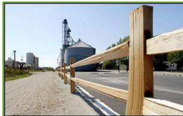
buy photo | zoom

The extension, funded by a $200,000 grant from the Wisconsin Department of Natural Resources, elongates the trail to nearly 20 miles.